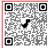
MUNACA Website English