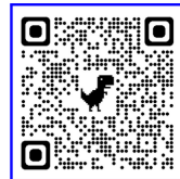
MUNACA Website French